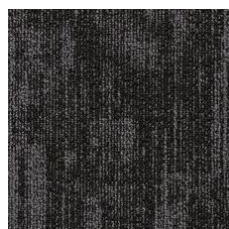
System 67505 LRV 6.6